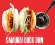
SAMURAI DUCK BUN